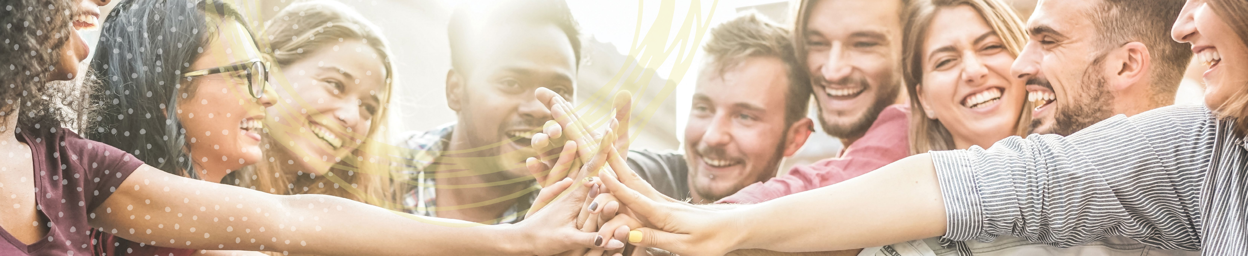
TABLE OF CONENTS