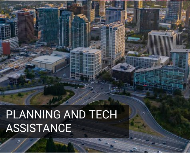
PLANNING AND TECH ASSISTANCE