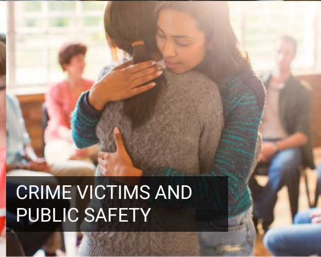
CRIME VICTIMS AND PUBLIC SAFETY