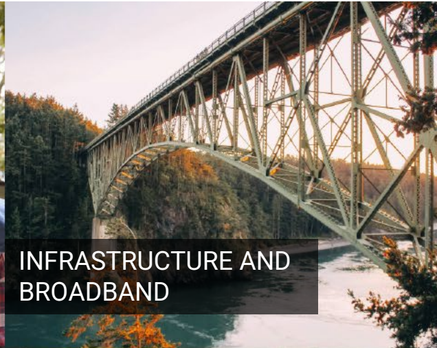
INFRASTRUCTURE AND BROADBAND