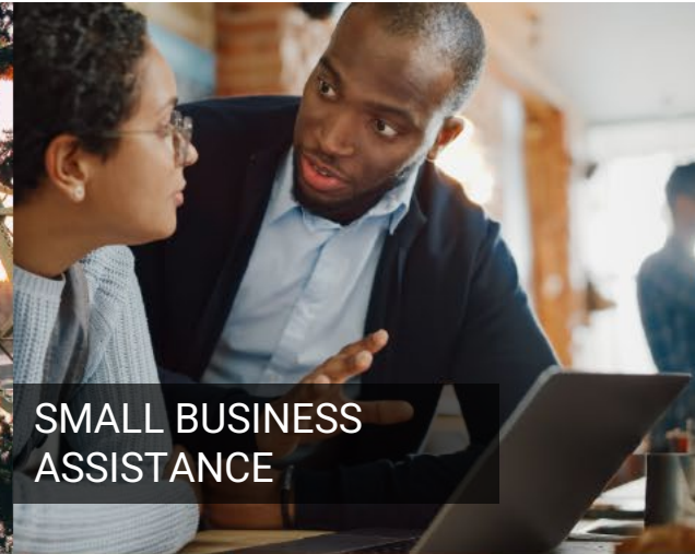
SMALL BUSINESS ASSISTANCE