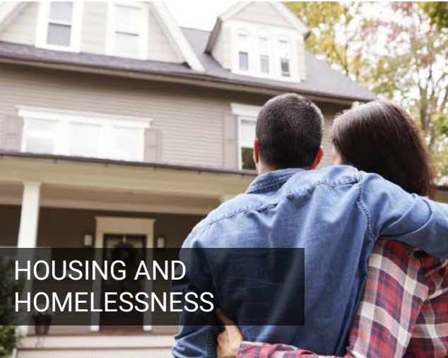
HOUSING AND HOMELESSNESS