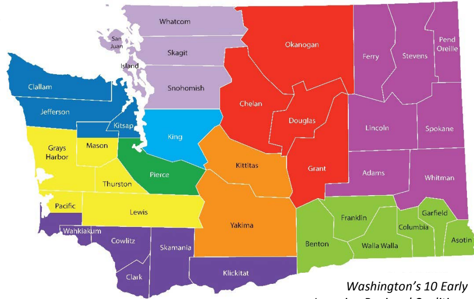
Washington's 10 Early Learning Regional Coalitions

In addition to ensuring family home and center providers were well represented in the groups, 22% of participants were members of SEIU 925, and 5% were Tribal providers.